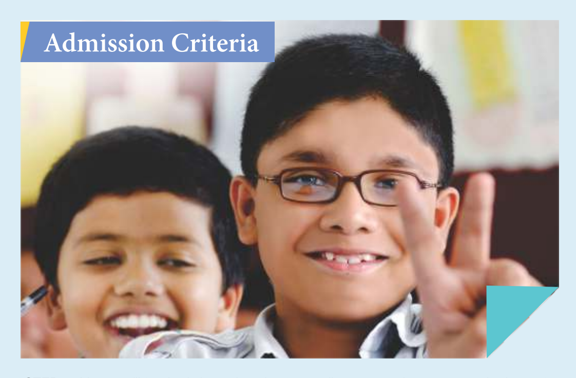
STEP - 1 You can fill & submit the registration form online at www.dpsrau.org or obtain one from parent facilitation centre at DPS Rau, Indore. The payment as well as submission of documents can be done online too. Note: Incomplete forms will not be accepted

STEP - 2 Fill the registration form with all the required information including personal information. Incomplete forms will not be accepted. Completed forms can be submitted to the admission counselor in the school campus. Parents are required to submit the following documents duly self attested along with the registration form.