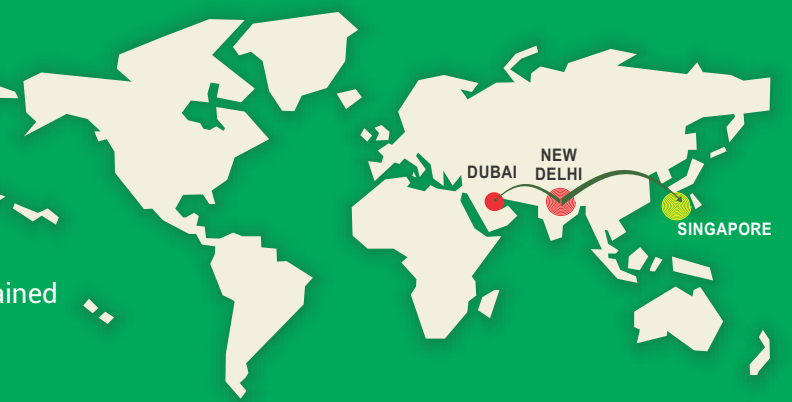
Six Decades of finest school tradition.

Over 4,00,000 students 25000 well trained teachers 135 outstanding principals 232 branches of DPS worldwide including Singapore.